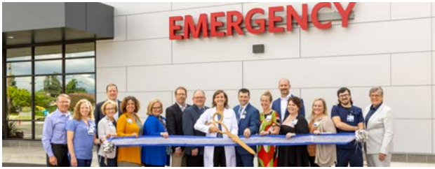
CMC celebrated the grand opening of its new Emergency Department with a ribbon-cutting ceremony.