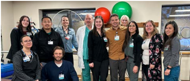
Team members at CMC were recognized as Montana's best rehabilitation hospital by U.S. News & World Report.